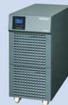
UPS - Type S Without batteries