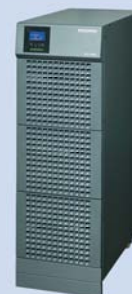
UPS - Type M With batteries