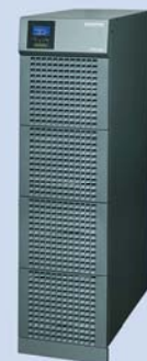
UPS - Type T With batteries